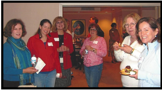
Associates enjoy being together,