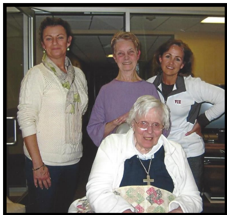
And caring for others.